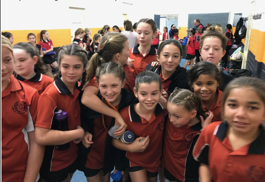
Lucky Caralee CS girls at the Dockers Cup Curtain Raiser