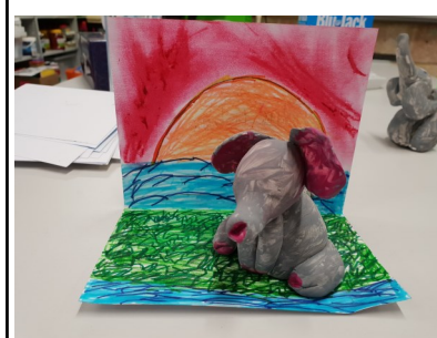
Clay model by Monet (B2)