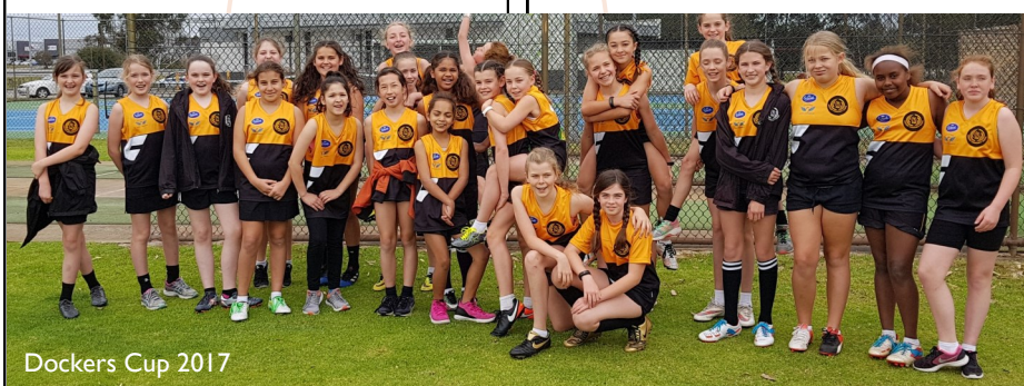
Dockers Cup 2017